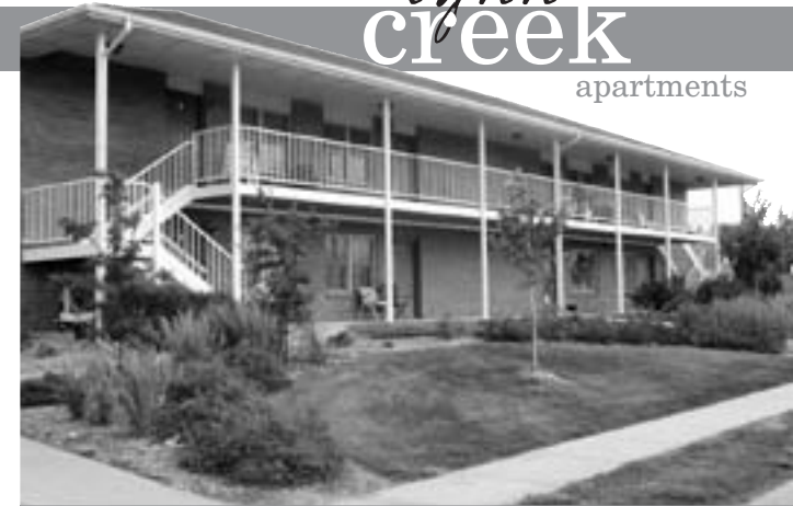
920 & 930 Garber Avenue